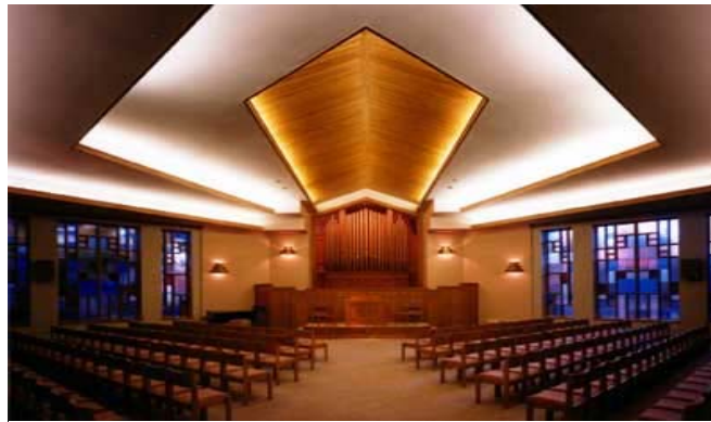
First Unitarian Church of Denver, view of sanctuary.

In contrast to its exterior, First Unitarian's interior space was completely renovated, replacing traditional design with a more contemporary look and movable chairs for more flexibility in worship styles. Efforts were made to bridge the differences between old and new, however. An original stained glass window of the Good Samaritan, which the congregation was able to save from their previous church, was installed in the entryway to the sanctuary and the organ pipes in the choir loft, which also survived the blaze, were reinstalled to keep continuity with the past. First Unitarian credits the awareness and commitment of their committee members and congregation to the significance of their building and their selection of an experienced historic preservation architect as the keys to their successful renovation and preservation project.