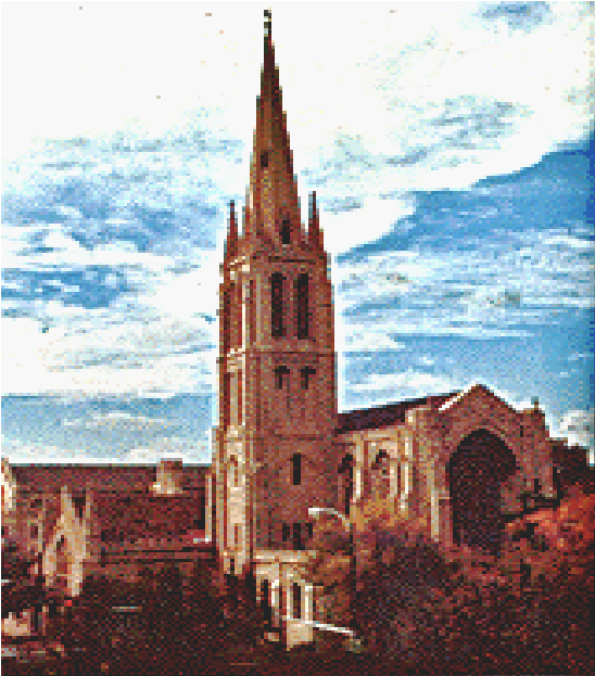
First Unitarian Church, Chicago, IL

First Unitarian rents space to a variety of area institutions and groups whose fees account for half of the church's operating budget. The nearby University of Chicago Business School leases all of Fenn House for its programs and a ballet school, day care center, lesbian women's support group, and aerobics exercise group, to name a few, rent space in Pennington Hall and the church itself. The rental fees from these groups cover one hundred percent of the church's janitorial and utility costs with a healthy sum left over to go towards church programming. The financial benefit of sharing their space does present some challenges and pressures, however. Having so many members of the public inside their buildings requires careful oversight and organization on First Unitarian's part. Occasionally the users' needs conflict with the church's and First Unitarian anticipates having to renegotiate with some of their leasers as the church grows its own programs.