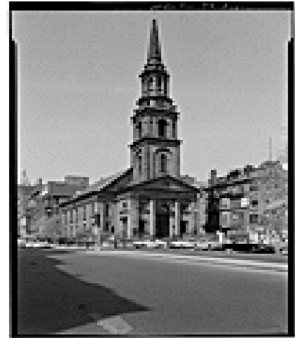
Arlington Street Church, Boston, MA

The final report said that Arlington Street Church would need $2.2 million to complete the renovations necessary to preserve the building. The steeple on the church was about to collapse and needed immediate attention. By 1996, Arlington Street had raised $1.2 million, thanks in part to a $200,000 grant from the Massachusetts Preservation Projects Fund, administered by the Massachusetts Historical Commission. The money raised in this first phase of the capital drive went towards steeple maintenance, brownstone restoration, downspout, gutter and flashing repair, and clock repair. This was supplemented by a small grant from Historic Boston Inc.'s steeple lighting grant program, which paid for spotlighting on the newly repaired steeple. Arlington Street's Renovation, Access, and Preservation Committee and their Capital Campaign Committee oversaw the renovation work, bringing both fundraising and architectural expertise into the supervision process.