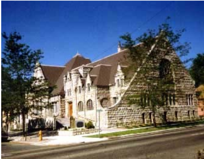
First Unitarian Church, Denver, CO

preservation experience to help them implement their plans.